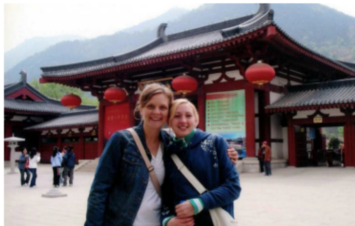
Trip to China