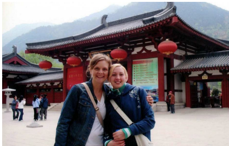
Trip to China